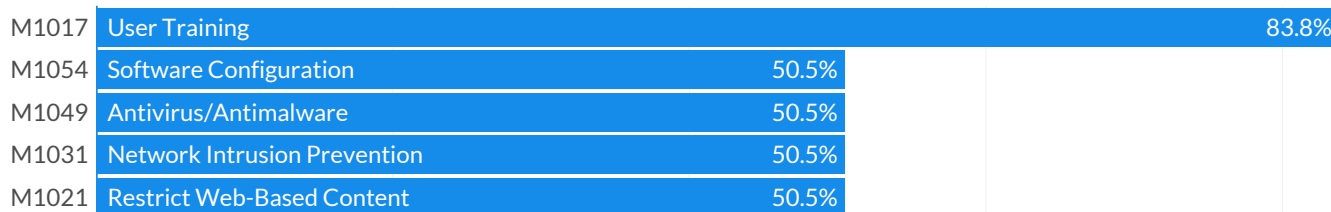
Figure 3—Sector’s top initial access techniques and mitigations

Observed in 50.5% of cases, phishing is the most common way ransomware is initially introduced into healthcare organizations. The other top techniques for initial access, including valid accounts, drive-by compromise, external remote services, and replication via media were utilized much less frequently in 14.1 to 33.3% of cases.